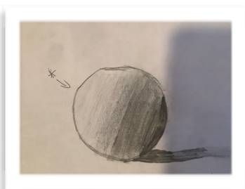
Destiny R. Grade 5