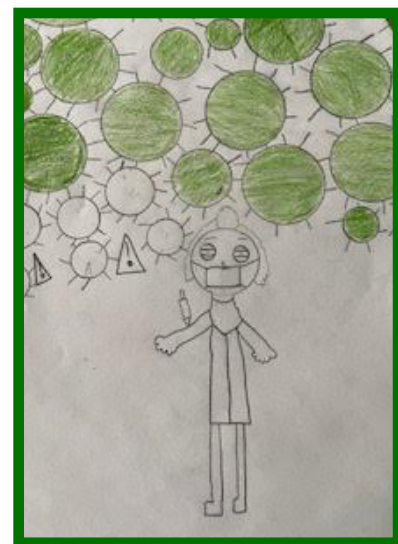
Grade 6 Visual Art Demia A