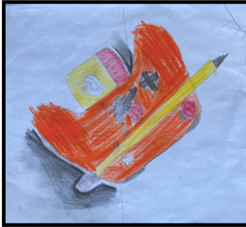
5th Grade, Stephen Smyntek's start of his still life showing value with the use of shadow and color.

Students are in the process of composing geometric forms into a Still Life using shading, blending, and textures with mixed media of choice to personalize our own style of art as an artist.